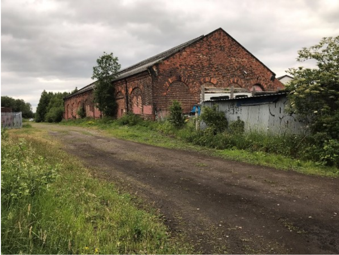
The rather sad-looking building at Whessoe Road - Paul Bruce