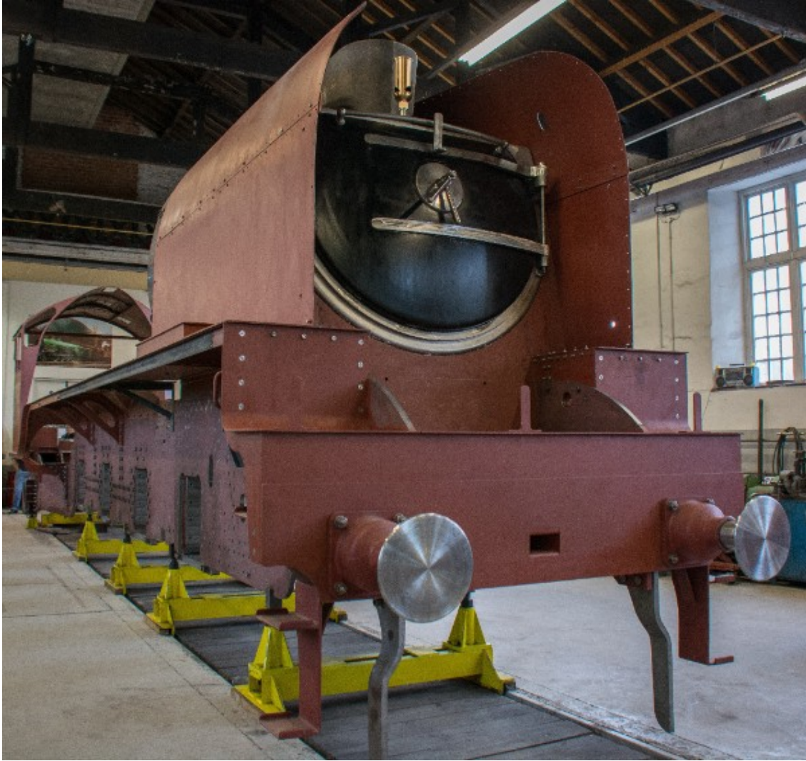
The impressive sight which greeted Covenantors arriving at DLW – Mandy Grant